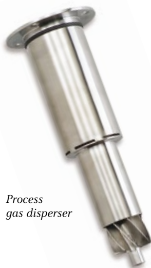
Process gas disperser

The GEA Niro SDMicro™ is easy to dismantle for simple cleaning and fast product switching.