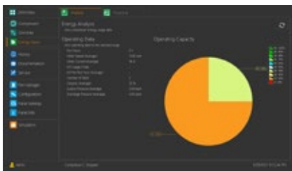
GEA Omni™ Energy Saver functions allow operators to evaluate system energy usage and adjust for maximum benefit.