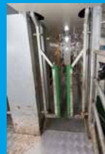
One Way Gates.