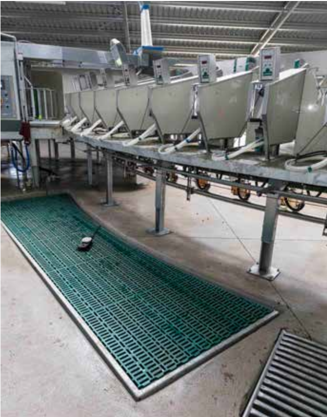
EGO floor shown at lowest level.