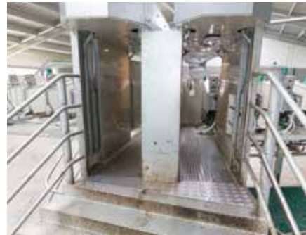
Guided chute for entering the parlour.

The external parlour also comes with a camera and monitor as standard. The camera is situated at cups off and allows the operator to observe animals before exiting. If the goat requires further milking a button push can be easily accessed and prevents the head lock from opening, it will be held in the stall for another rotation, passing the bridge with no interruptions to entering or exiting goats. A second camera can be mounted as an option to observe what is happening in an other area, i.e the yard.