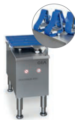
GEA Check 4000