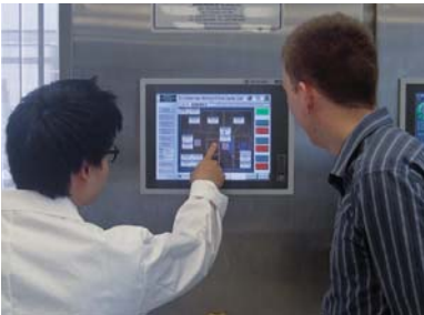
Training programs by experts

Of course we won't leave you alone when your systems have been installed. We support you during your plant operation, assure optimal maintenance, supply wear and spare parts, and are quickly there when your refrigeration systems unexpectedly have difficulty. In short: we are responsible for absolutely satisfactory operation – with companies around the world, and with highly competent staff.