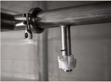
Worldwide service support

Of course we won't leave you alone when your systems have been installed. We support you during your plant operation, assure optimal maintenance, supply wear and spare parts, and are quickly there when your refrigeration systems unexpectedly have difficulty. In short: we are responsible for absolutely satisfactory operation – with companies around the world, and with highly competent staff.