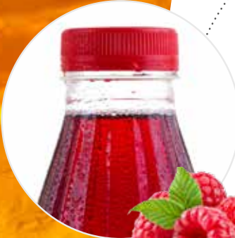
Iced tea and fruit infusions