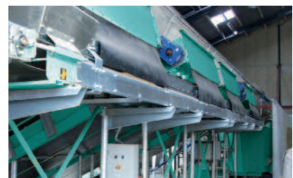
High effective system – conveyor takes the roughage to the mixer