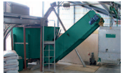
Fresh energy: The stationary mixer (MVM) and the feeder work hand-in-hand to make high-quality feed

The battery-driven feeder operates busily, but quietly and always precisely, in its distribution of the exact TMR to the various groups. The conveyor belt on the Mix & Carry feeder enables it to dispense either on one or both sides of the feed alley. Its narrow construction form makes the feeder extremely flexible. A width of just 2 m is sufficient for the serving of feed. When setting up a new cow barn the narrow system offers a great deal of saving on space. Increase your productivity using a smaller area!