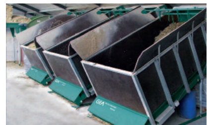
Workload: A minimum of effort is required for the filling up of the bunkers as needed

Mix & Carry reduces the workload down to just the occasional filling up of the bunkers and silos. The frequent distribution in a relaxing atmosphere improves both the feed intake and, as a consequence, the feed utilization. The continuously new mixture ensures that the feed is always kept fresh and free of fermentation processes. The cows always relish the optimal feed ration, and the clean facts at the feed alley speak for themselves: Your healthily fed cows will always reward you for this with top-quality milk!