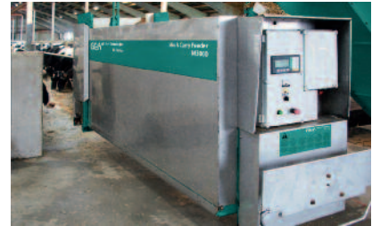
Productive feeder – a new companion in the cow barn that the cows are totally happy to accept

You can provide every group of cows with the menu desired using individual mixtures. The user-friendly WIC control unit gives you quick access to feeding schedules, ingredients, quantities or parameters of the animal groups. Once it has been started up the Mix & Carry system carries out the complete process starting with weighing in from bunkers and silos, mixing in a stationary mixer and distributing by the rail-mounted feeder. Of course not without reporting to you in details on every step taken. Mix & Carry frees a considerable amount of time for you to utilize for intensive herd management, enabling you to closely pursue the goals in your concept and to optimize your long-term success.