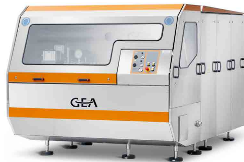
GEA Ariete Homogenizer 5400

Ariete Series are fully compliant with the Regulation (EC) N. 1935/2004 and all food and pharmaceutical requirements - including the most stringent certifications (USDA, FDA, CE, 3-A Sanitary Standard, Atex, cGMP).