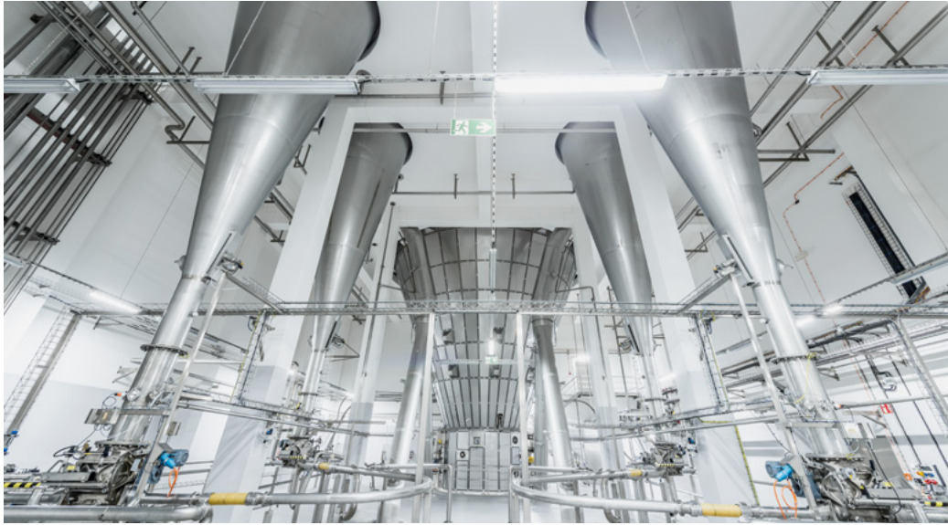
GEA MSD® spray drying plant

After evaporation, the concentrate moves via small buffer tanks to the spray dryer feed line. GEA spray dryers for nutritional products are typically equipped with two or more feed lines so that the spray dryer can operate 24/7. Each of the feed lines can be cleaned individually without stopping the dryer. This not only maximizes dryer utility, but also reduces the risk of scaling.