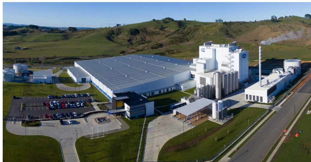
Complete nutritional formula factory

Nutritional formulas represent important sources of key dietary components, including proteins, carbohydrates, fats, vitamins and minerals. Each formula will have a precisely defined composition, and can offer complete nutrition for infants and important dietary supplementation for seniors and individuals who have special nutritional requirements.