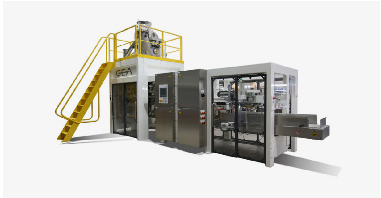
RBF-800Li (Limited Intervention) powder filling system