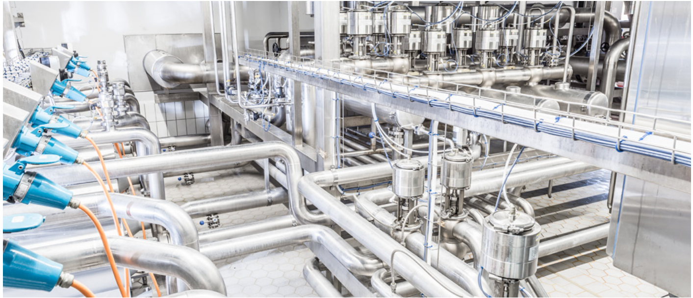
GEA CIP station

Our innovative CIP solutions also meet all critical hygiene standards to guarantee product safety at every point of the process. Tailored solutions configured to meet individual requirements ensure efficient commissioning, while also reducing total cost of ownership, for example, by optimizing the use of water and detergents. Seamless integration of technologies, coupled with sophisticated plant automation, safeguards trouble-free operation and maintenance, to deliver solid financial benefits.