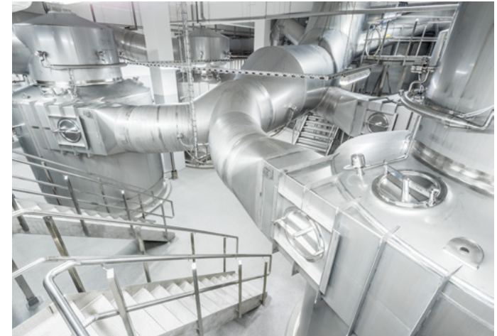
Dryer exhaust system

We offer a wide range of evaporation solutions, which we adapt to your specific requirements. All of our solutions are designed with optimum hygiene and product safety features, minimizing energy consumption through the use of energy-efficient technologies and energy recovery functionality. All of our falling film evaporators are equipped with a liquid distributor, which utilizes the best hygienic design.