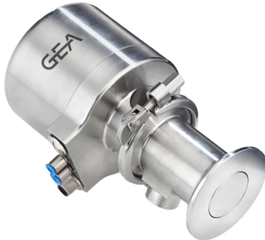
GEA CIP nozzle

Because we recognize hygiene as a safety issue, our component and plant designs are based on a hygienic design, which is informed by guidance coming from global standards organizations.