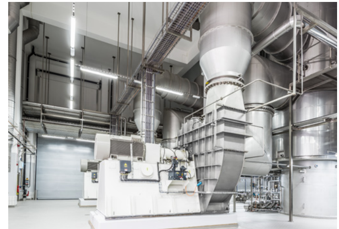
Evaporator with MVR fan