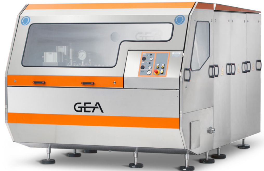
GEA Ariete Homogenizer 5400