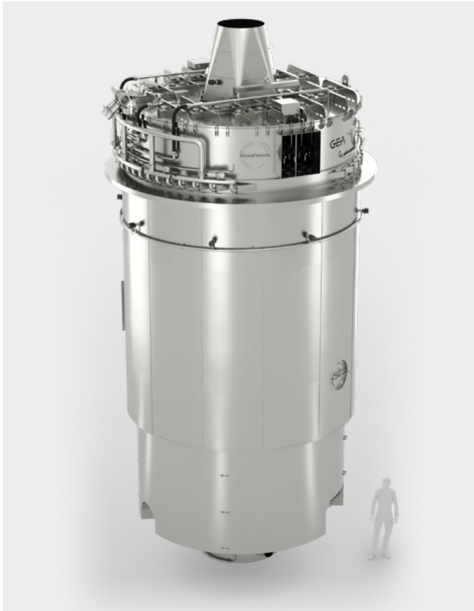
GEA SANICIP® bag filter

We can size the spray drying chamber to match the required capacity, and tailor the equipment according to the type of atomization and the product to be dried. For nutritional products, the typical choice is the MSD® chamber, which is equipped with a DDD® air disperser, a static, integrated fluid bed in the bottom and an air exhaust in the top of the chamber. This configuration aids agglomeration, which is a key property that determines wettability and solubility, and ensures uniform bulk density.