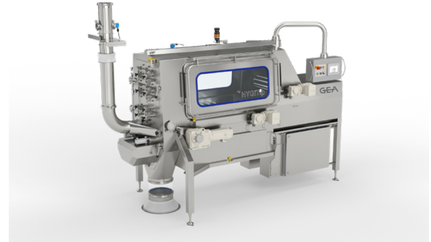
GEA HYGiTip Bag Emptying System

For small amounts weighing and dosing could be carried out as manual operations, whereas for larger quantities minor ingredients may be handled using a semi automatic or automatic system. We can configure a solution that will meet your processing needs.