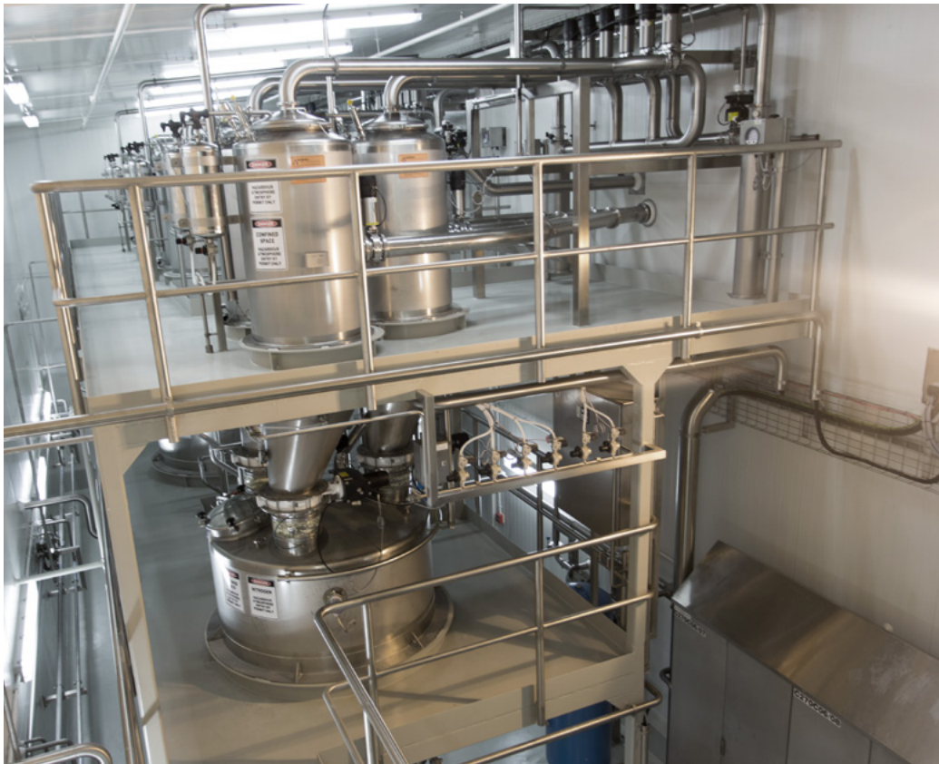
Pre-gassing system for modified atmosphere powder packing lines (MAP)

Powdered ingredients are unloaded and conveyed to intermediate storage units. Base powders and ingredients can be dry-mixed to achieve a homogeneous product, which is then either gravity-fed or conveyed to the packaging plant.