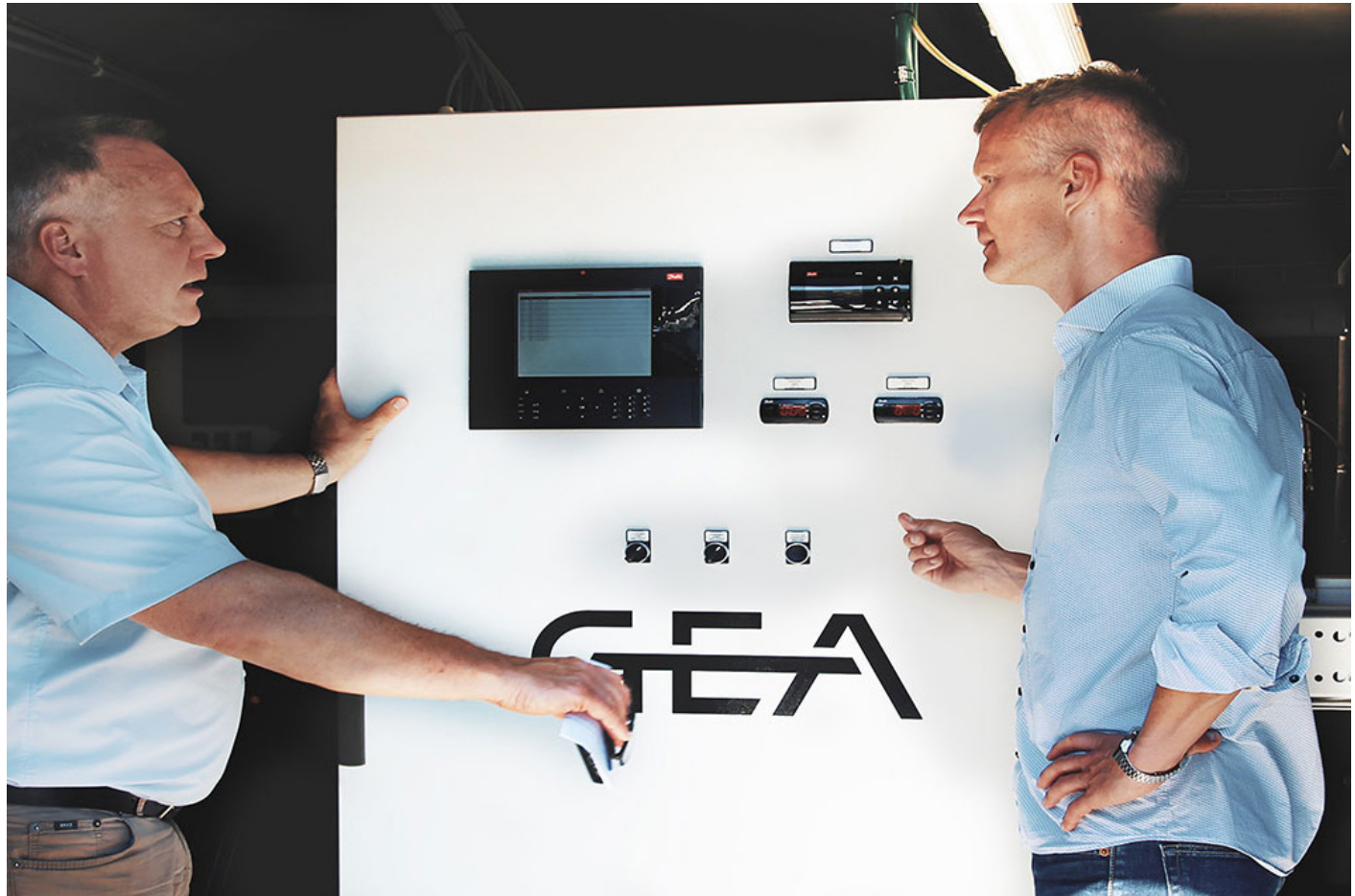
GEA AddCool high temperature heat pump solution