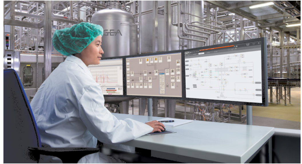
GEA Codex®: scalable automation solution

Reliable automation systems are vital to ensure optimum process performance. We appreciate that every customer will have specific requirements, so we tailor individual automation solutions that combine proven hardware from selected suppliers with GEA Codex® software modules.