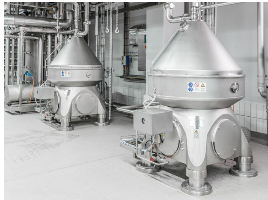
MSI skimming separator