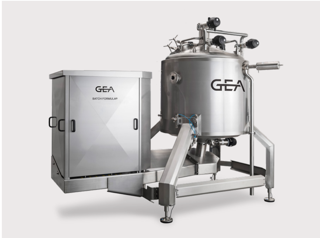
GEA BATCH FORMULA® PRO High Shear Mixer

Every infant milk formula is blended as a precise mix of multiple ingredients. These may include dry powders and different oil types as well as the liquid milk or whey products. Each ingredient will require a particular solution for safe and reliable handling.