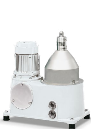
OTC 2, OTC 3