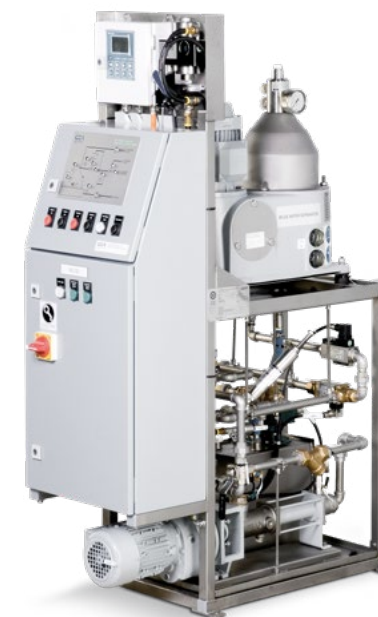
GEA BilgeMaster 200