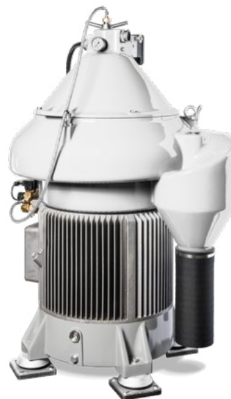
GEA marine Separator 6