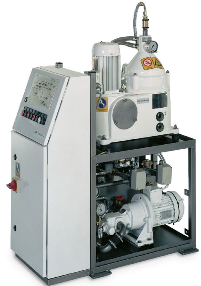
Skid for diesel oil treatment with a capacity up to 1,200 l/h.