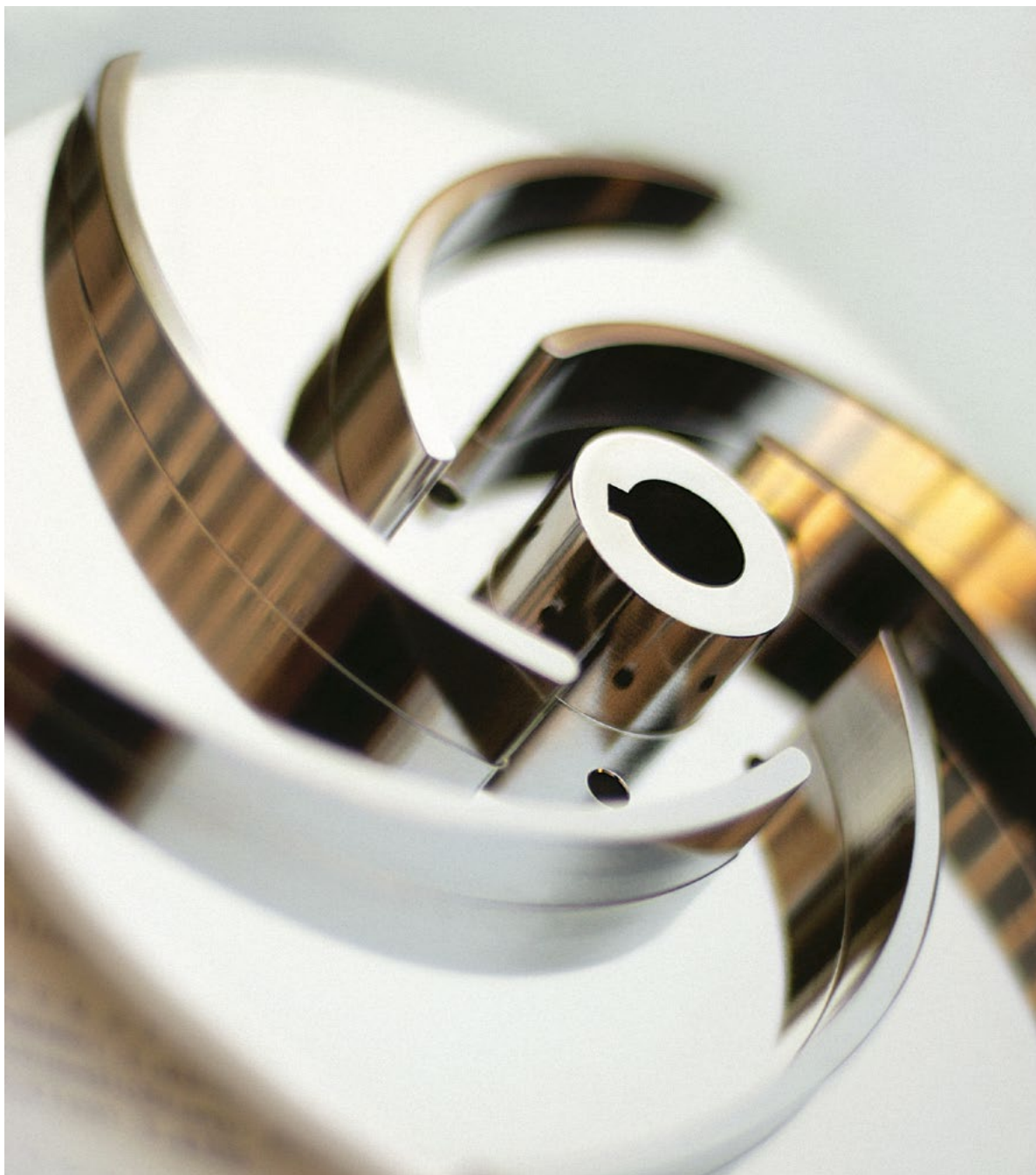
Figure 5 Milled impeller, R_a \leq 0.4 \mu\text{m}