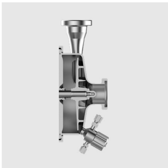
Right Figure 2 Section of GEA Hilge CONTRA (5-stage)