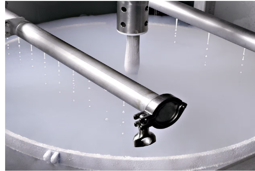
Liquid Nitrogen Freezer