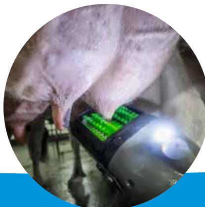
LED light improves teat visibility