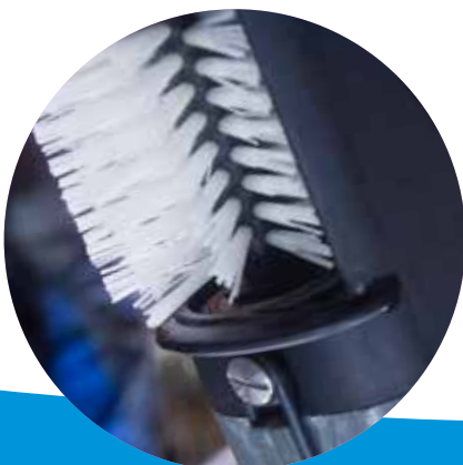
New guard stops solution from dripping back on operator