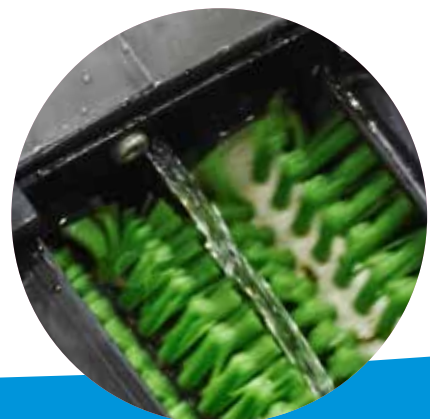
FutureCow prep solution helps to reduce mastitis causing organisms