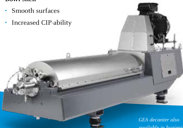
GEA decenter also available in hygienic design